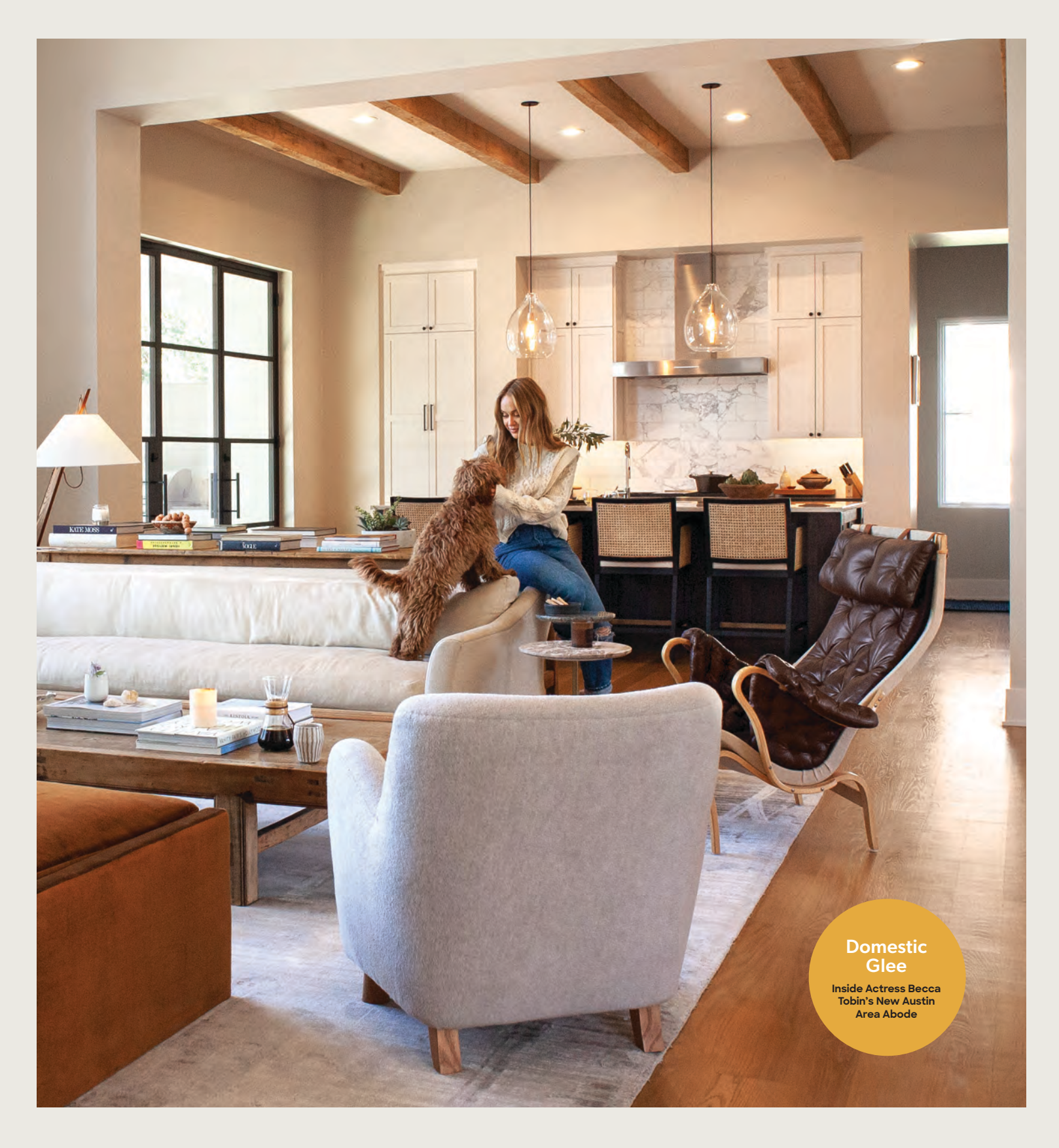
+ Gorgeous Homes that Connect with the Outdoors & Austin's Best Builders